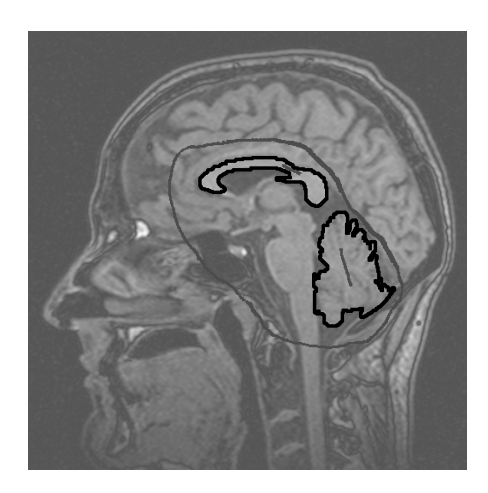
Fig. 1 . Example of the multilabel segmentation obtained from the algorithm of [3]. Gray marks represent the result of user interaction ( i.e. , seeds) to indicate three objects (corpus callosum, cerebellum and background). Thick black lines indicate the computed segment boundaries. Even though no prior knowledge is built into the algorithm to find a particular object, the algorithm correctly segments both objects, despite unusual shapes and textures.

Scientific Computing and Imaging Institute 3490 Merrill Engineering Building Salt Lake City, UT 84105