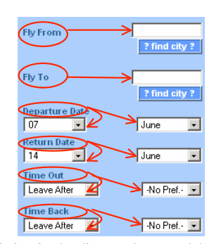
Fig. 3. Variation in the distance between labels and elements

structure of the forms in these two domains, we observe that in Airfare , there is a large variation in distance between labels and elements, even within a single form. This is illustrated in the form shown Figure 3. In this form, whereas some labels are placed very close to the corresponding elements ( e.g. , Departure date), others are relatively further ( e.g. , Fly from). In contrast, for Movie , the labels are more consistently placed close to the corresponding elements. Consequently, it is harder to correctly predict labels for the more heterogeneous Airfare domain than for the Movie domain.