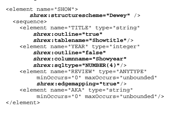
Figure 2: Annotated movie schema

tributes in a document are represented in the relational schema. Figure 3 shows the relational configuration for the annotated schema of Figure 2. The annotation out-line="true" in the element TITLE indicates it should be mapped to a separate table; and the annotation tablename specifies that this table should be named Showtitle . The element YEAR, on the other hand, has its outline attribute set to false, consequently it is inlined in the table corresponding to its parent element, SHOW. The annotations sql-type and columnname in the YEAR element specify that it should be mapped to a column named Showyear and SQL type NUMBER(4) . Although not illustrated in the example, an element can also be mapped into a CLOB, using the annotation maptoclob .