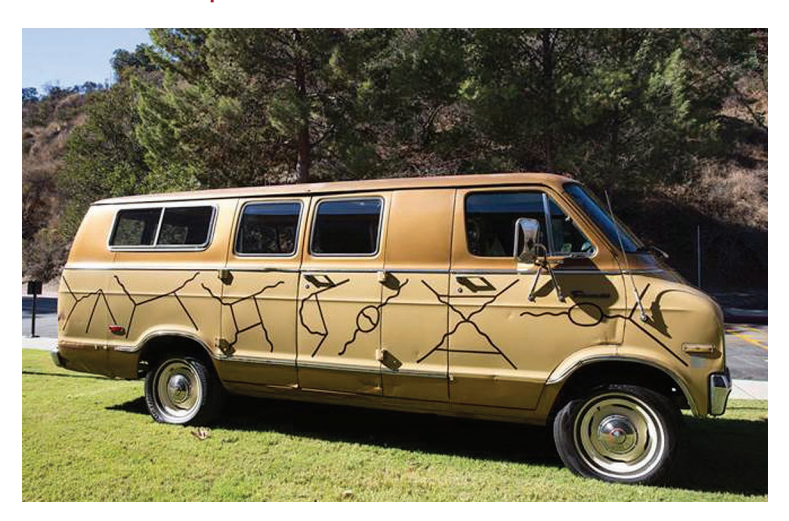
Figure 2. Richard Feynman's 1975 Dodge van. Feynman had the behavior model of subatomic particles painted on the sides.

In most disciplines, model development has been a driving force for progression. It fuels and guides the advancement of a subject by enabling abstraction, proposition, prediction, and validation (using experimentation, mathematics, and computation). Models are central to what researchers do, both in their research and when communicating their explanations. The development of the standard model in particle physics was a collective effort of scientists around the world throughout the second half of the 20th century. In the same way, the discovery of the double helix model of DNA was an iterative research endeavor in the early 1950s. Many intermediate steps, ranging from the partial model alpha helix and the incorrect triple helix model by Linus Pauling to xray diffraction experiments by Rosalind Franklin and others, paved the way for James Watson and Francis Crick to formulate the landmark model in biology.