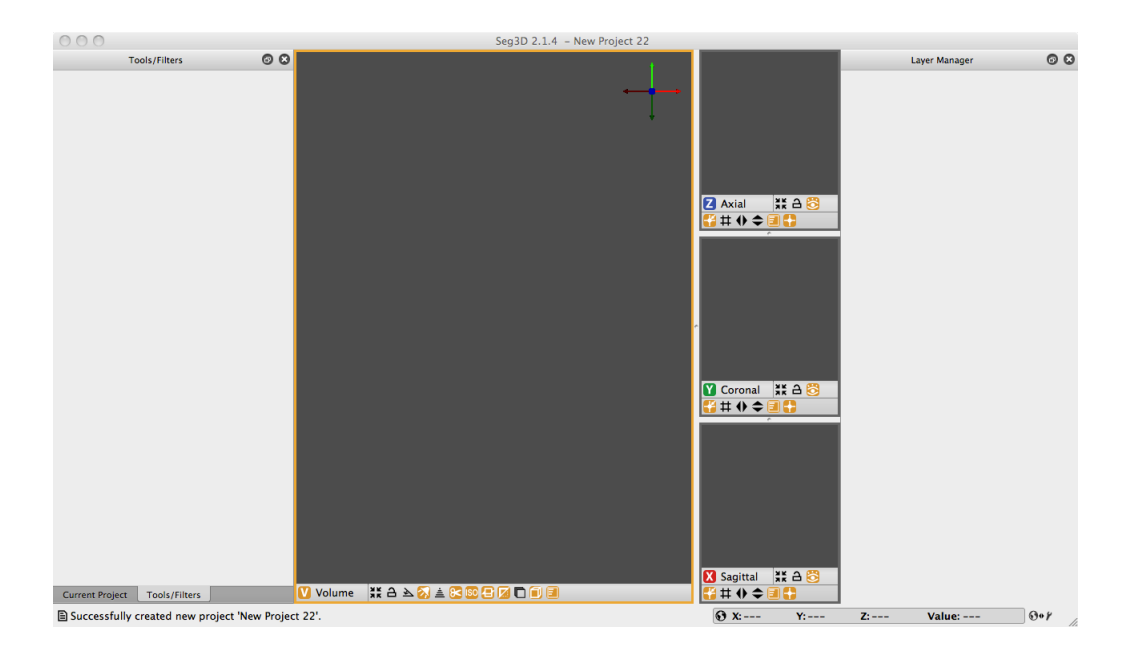
Figure 3.2. Blank workspace of Seg3D

you have finished creating the project you will see the blank Seg3D workspace (Figure 3.2). You will not be able to do anything useful until you load some data, so click on File and Import Layer From Image Series... or Import Layer From Single File..., depending on the data you have. Image series refers to a data type that consists of several individual files that can be stacked in order to create a volume, file formats such as dicoms or tiff stacks. Single file refers to data stored in one data file, such types as .nrrd or ITK files. The data shown in the demo is a dicom data series, located at software/Seg3D/data, and is a good data set to try first. Once you click Import Layer From Image Series..., find the example_image_data folder and choose one of the many .dcm files there. You will be asked how to load the data, and you will choose the only option, which is as a Data Volume.