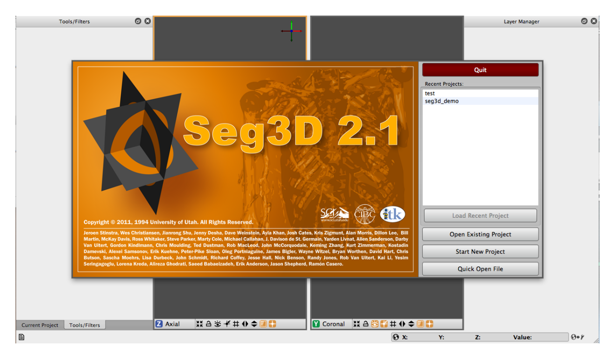
Figure 3.1. Welcome screen for Seg3D

When you start Seg3D, you will be greeted by the welcome screen (Figure 3.1). As you will see, you have some options: you may load a recent project from the list (likely to be empty), open a project that you have saved on your machine, start a new project, take a quick look at a single segmentation or image file, or you may quite Seg3D if you have changed your mind.