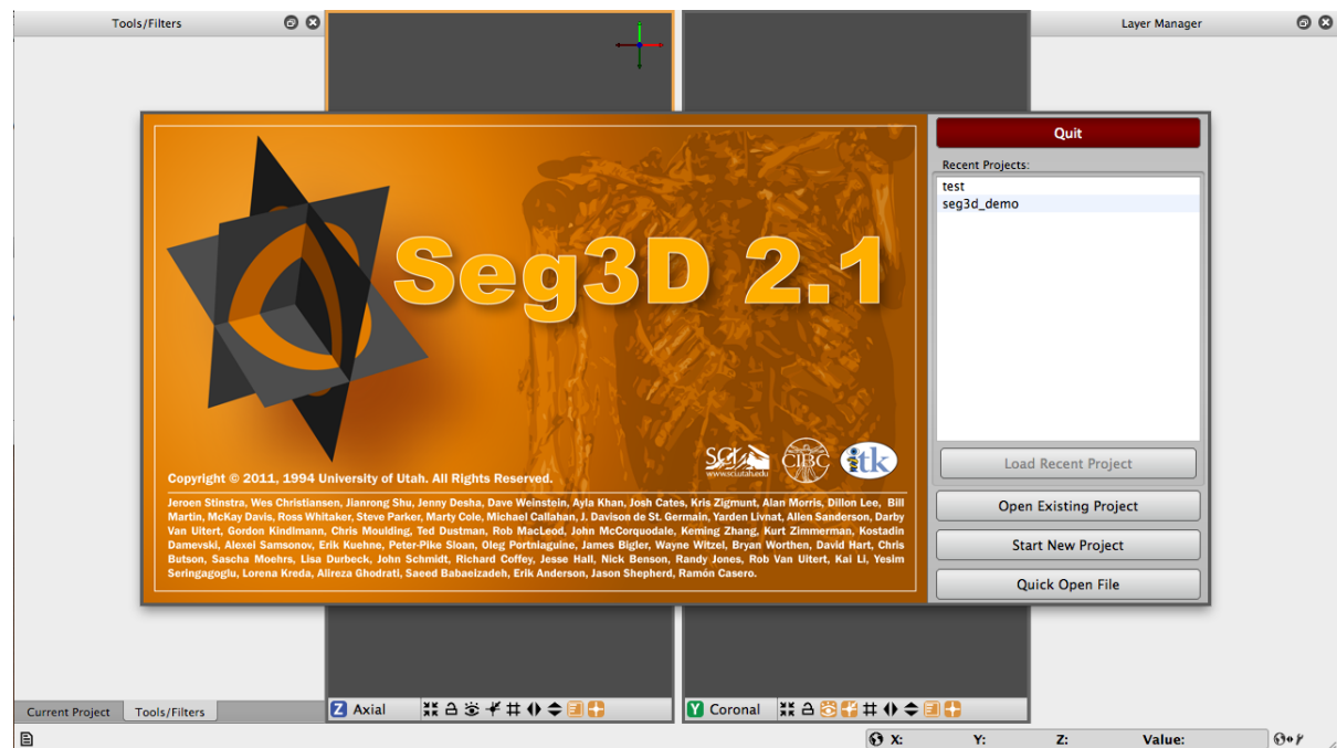
Figure 3.1. Welcome screen for Seg3D

at a single segmentation or image file, or you may quite Seg3D if you have changed your mind.