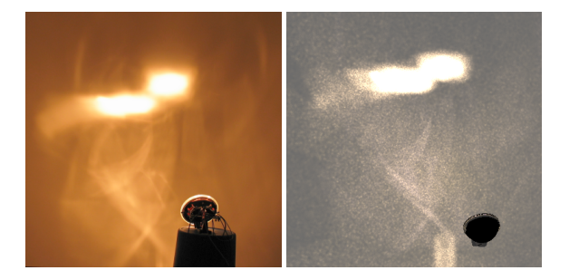
Figure 4: Simulation of a caustic from a (real) car headlight, which can be inspected interactively. Left: In order to reproduce the detailed patterns of the spread-out caustic, 2.2 million photons have been used. Using our optimized kdtrees, the frame rate could be improved from 0.24 to 0.44 frames per second (on a single CPU). Right: a photo of the real lamp, for comparison.

per second. Using 5 dual-CPU PCs, this corresponds to 4–5 frames per second at video resolution even for this highly detailed caustic.